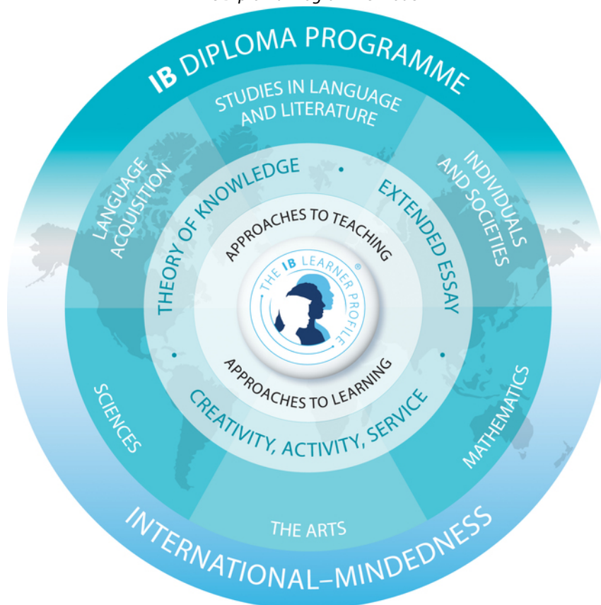
The Diploma Programme model